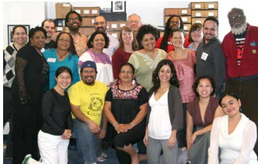
First national gathering of TRPT members at the Strategy Center, Los Angeles, 2009

“The fight for sustainable and equitable transportation is, at its core, a fight for the public health and quality of life of entire communities and the entire globe”