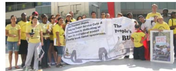
Bus Riders Union participates in National Day of Action

In 2001, the Supreme Court in effect took away a key civil rights tool for communities of color by limiting their ability to bring private lawsuits to enforce disparate impact regulations. TRPT is leading an exciting campaign to restore civil rights protections for transportation, creating a tool to redress racial discrimination in federal transportation investments under the Federal Surface Transportation Act.