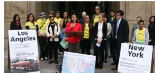
National Day of Advocacy Press Conference