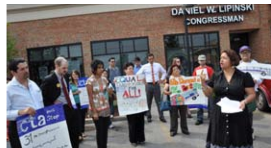
Little Village for Environmental Justice rally for Operations Funding